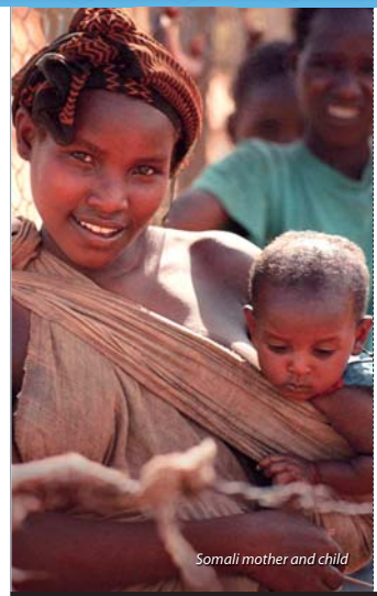
Somali mother and child

and suicide bombers, with the sole purpose of killing every Australian that dared step foot on African soil.