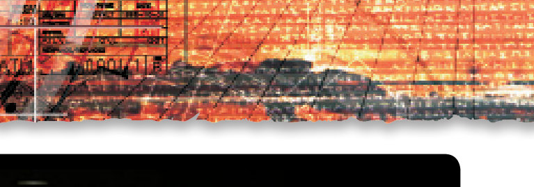
Figure 2 details the 'freeze' periods applied after an unsuccessful attempt at testing. You can see clearly why a Year 12 student who attempts the aircrew aptitude test and

you can sit the aircrew aptitude test. A pass in the aircrew aptitude test gets vou to flight screening and the officer