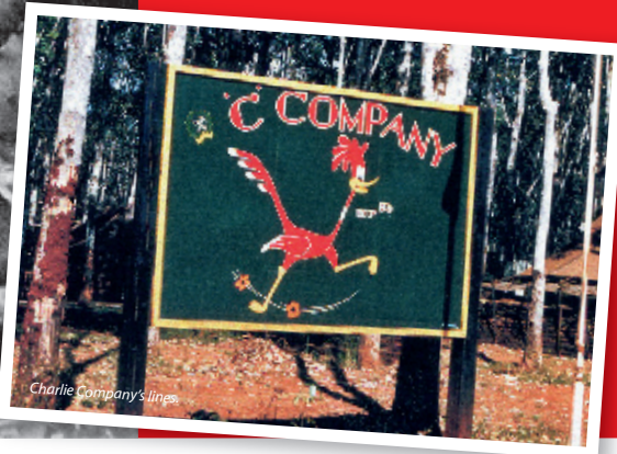
Charlie Company's lines

"seven air strikes were made in all, two of them with napalm within 100 metres of us, as well as almost continuous fire from helicopter gunships.