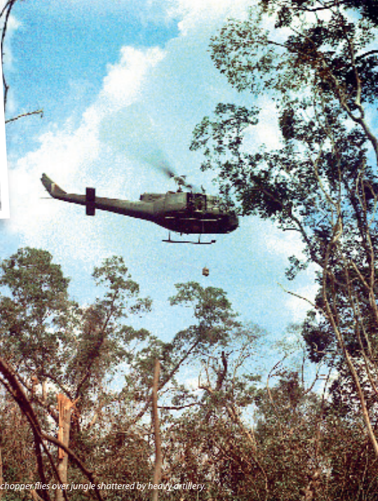
A resupply chopper flies over jungle shattered by heavy artillery.