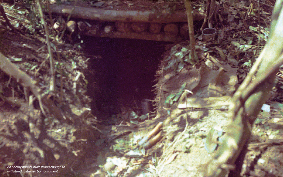
An enemy bunker, built strong enough to withstand sustained bombardment.

"probably one of the most brilliant actions ever fought by an Australian rifle company"