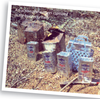
A fraction of the stores captured in the bunker system